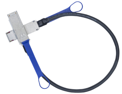
Table 1 - Cable Specifications and Ordering Information

Optimizing systems to operate with Mellanox's 40Gb/s passive copper cables significantly reduces power consumption and EMI emission, eliminating the use of EDC hosts.